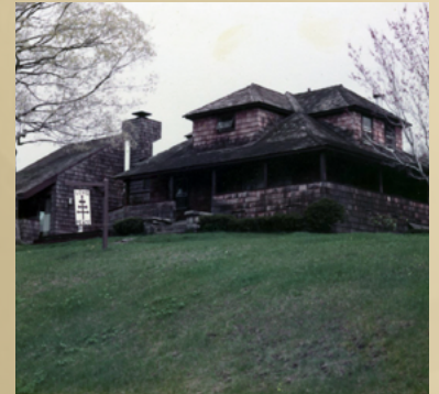
First monastery in Palmer, Massachusetts.