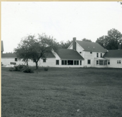
Most Holy Trinity Monastery moves to Petersham, Massachusetts.