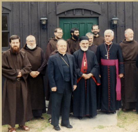
Patriarch Nasrallah Sfeir visits Most Holy Trinity Monastery.