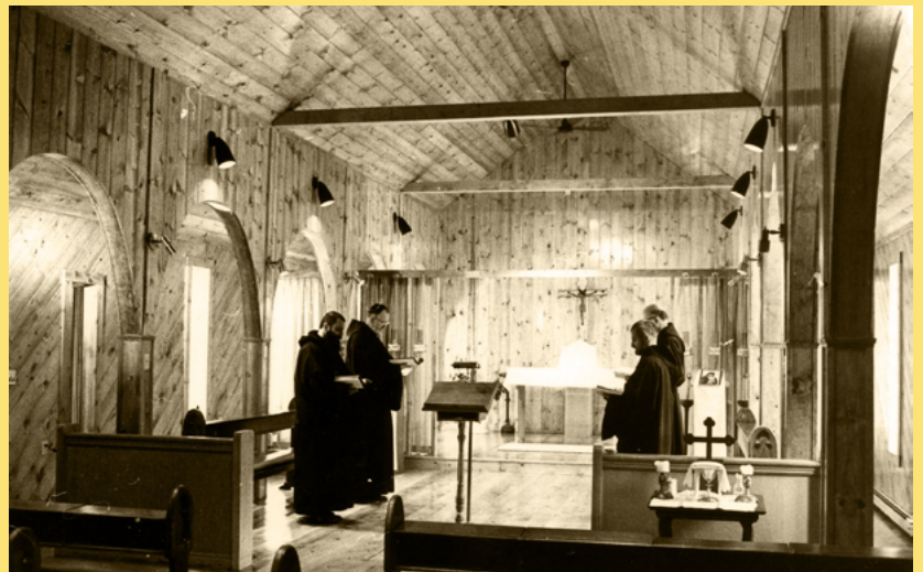
Then and now: The monks of Most Holy Trinity Monastery in Petersham celebrate the Divine Office in our original chapel. Below: The celebration of the Office in our present chapel.

As we celebrate forty years of living that life, we invite you to look back over the decades with us and thank God for the abundance of graces He has showered upon our founder and order. As Msgr. Montini (the future Pope Paul VI) once commented, “There is no more difficult work in the Church than to make a monastic foundation, exposed as it is to the spiritual opposition of the evil spirits as well as to innumerable obstacles in the domain of temporalities.” † Truly we have much cause for gratitude!